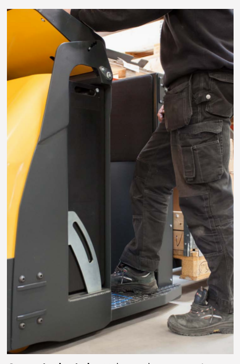
Step-in height What characterizes the MPL is the low step-in height and that one can easily go in and out of the truck on both sides. A essential part of an efficient order picking.

Efficiency The forklift can be equipped with several different fork lenghts for both one pallet but also with long forks to transport two pallets or three roll cages. The location of the wheels is adjusted for the handling required, at the same time the turning radius and stability is optimized according to the situation.