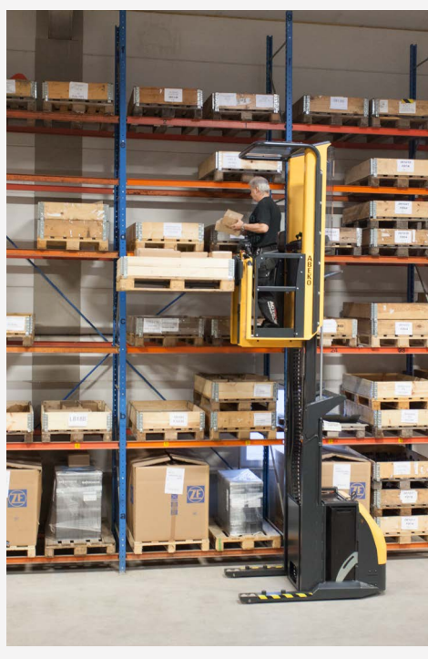
OPL 10 3.0 Lifts up to 3000 mm, which means that you can effectively pick on several levels. With protective roof and gates orderpicking can be done safely.