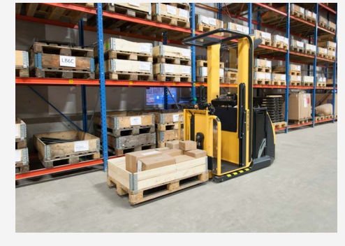
Working height The forks are adjustable to always have an optimal picking height. In the top position, the pallet is in perfect height so that the operator easily can put down goods without stretching.