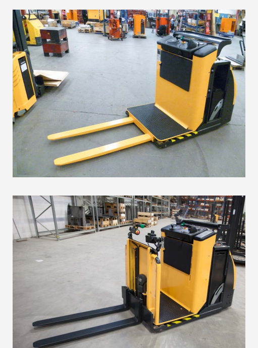
Ergolift / fixed forks All liftheights on our OPL can be equipped with either ergolift for an ergonomic picking or with fixed forks.

OPL 10 have free hanging forks and can therefore handle the most types of cargo. The forks can be adjusted in height or be ordered fixed into the chassie. OPL 10 comes in two different lift heights of platform 1200 and 2100 mm which means that you will reach a efficient order pick height of 3700 mm.