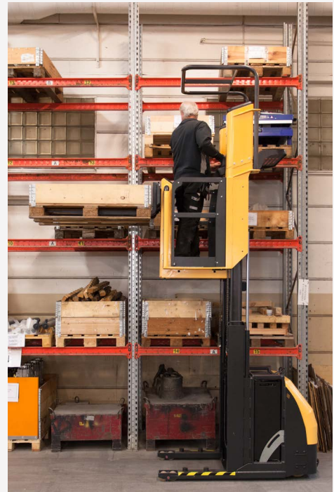
OPL 10 2.1 Lift up to 2100 mm makes picking on several levels easy and with overhead guard and side gates it ´s safe.