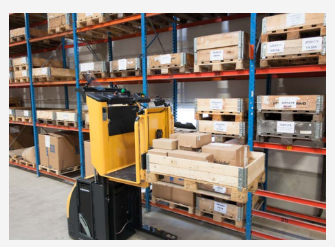
Workheight With ergolift the forks is adjustable to always be at a comfortable height. In it's up position the EUR-pallet is at a perfect height so that the driver easily can put down goods without strain.