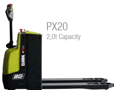
PX20 2,0t Capacity

Low chassis optimizes the view of the forks. The low chassis design is further enhanced by a tapered battery cover (PX), allowing optimum visibility of the forks and load .