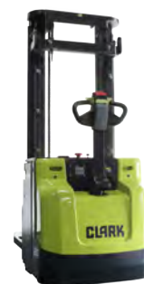
SX16 1,6t Capacity Max Lift: 5,210 mm