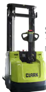
SX12 1,2t Capacity Max Lift: 5,210 mm