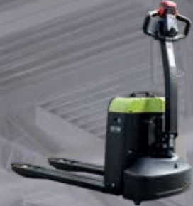
Low-lift Pallet Truck 1500 kg