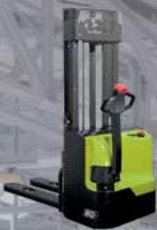
Pallet Stacker Multi-purpose Vehicle 2000 kg