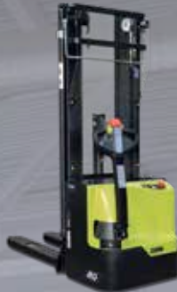
Pallet Stacker 1600 kg