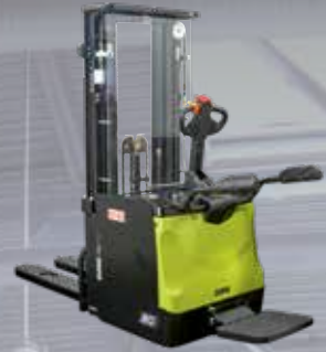
Pallet Stacker Platform version 1600 kg