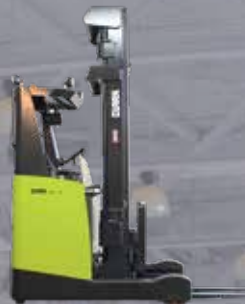
Reach truck 1400 / 1600 kg