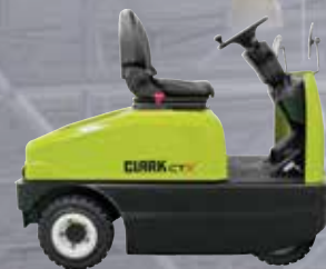
Electric Tow Tractor 4000 / 7000 kg