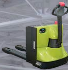
Low-lift Pallet Truck 2000 kg