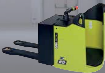
Low-lift Pallet Truck Platform version 2000 kg