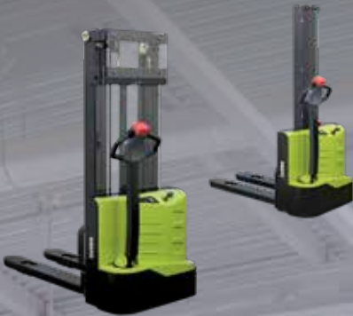
Pallet Stacker 1000 kg