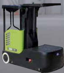
Multifunctional Order Picker 226 kg