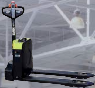
Low-lift Pallet Truck 1800 kg