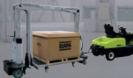
Tugging train with autonomous steering 1600 kg