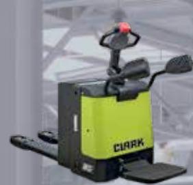
Low-lift Pallet Truck Platform version 2000 kg