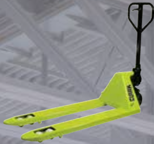
Hand Pallet Truck 2500 kg