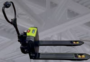
Low-lift Pallet Truck 1500 kg